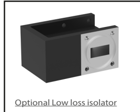
Optional Low loss isolator