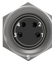
Connector for Monitor & Control Type: RS485, M8 female, 4 pin, A coded Functions: Alarm and Monitor & Control 1 = Alarm open collector (max. 200 mA) 2 = A pos+ RS485 3 = B neg- RS485 4 = Common (GND) 5 = Shield