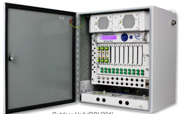
Outdoor Unit (ODU201)