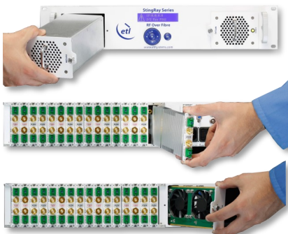
Indoor chassis showing hot-swap power supply modules, fibre modules and fans

Local control & monitoring via front panel push buttons & display