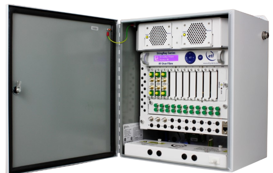
Outdoor Unit (ODU)