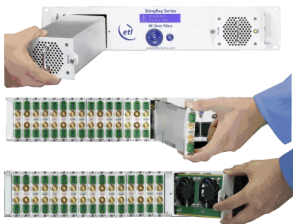
Indoor chassis showing hot-swap power supply modules, fibre modules and fans

Local control & monitoring via front panel push buttons & display