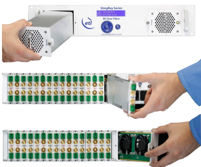
Indoor chassis showing hot-swap power supply modules, fibre modules and fans

Local control & monitoring via front panel push buttons & display