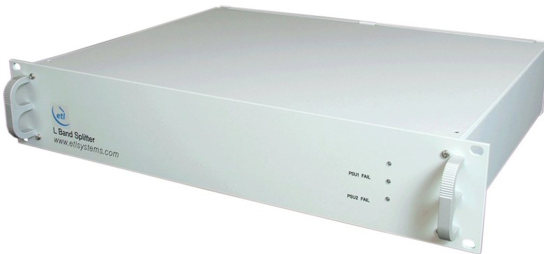
Front view of Model D0104Q2ULA-XXXX-D8

This splitter shelf contains 4 of ETL's 4-way active equalised splitter modules, housed in a 2U shelf. This unit benefits from dual redundant power supplies for reliability in service. Front panel LEDs provide a visual status for the power supplies, and monitoring can also be done via a dry contact alarm port on the rear panel.