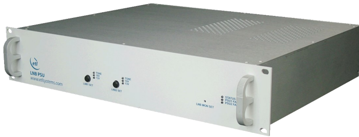
Front View of Model 22361-N5N5

With switchable 13/18V LNB Powering, 22KHz Tone, local & remote control & monitoring